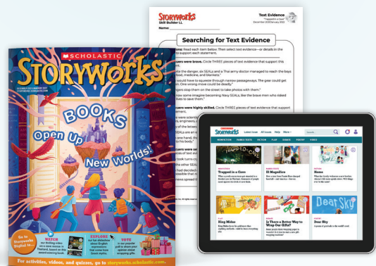
Grades 1–6 scholastic.com/swk